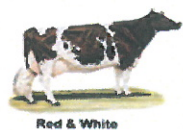
Red & White